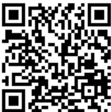
Akshat Koolwal AIR 352